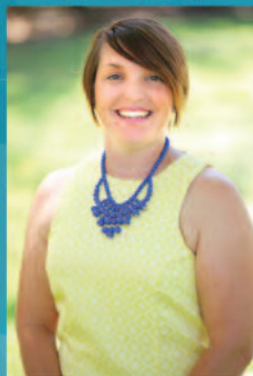
Mastrad Topchips Chip Maker