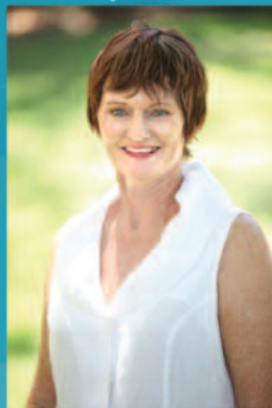
Clean eating plan