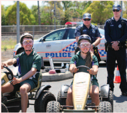
Lockyer District High School students learned important life lessons relating to alcohol and sexual health in sessions overseen by Queensland Police Gatton.

"All we can hope is that they take heed of the messages spoken today and make informed choices in their life after school," she said.