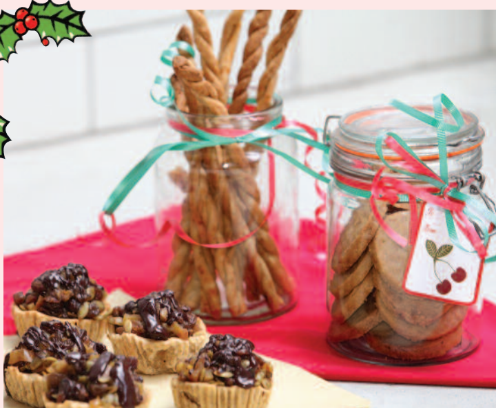
These delicious treats make ideal Christmas gifts for family and friends.

Preheat oven to 180C. Place all ingredients into a bowl, and stir well to incorporate. Place the dough onto one half of a piece of baking paper, and press down (using the other half) until it is about 1/2 inch thick. Cover, and place into the fridge for at least 20minutes. Remove from the fridge, and using a small cookie cutter, cut out the shortbread and place onto a lined baking tray. Repeat the process until all of the dough has been cut into shapes. Bake in the oven for 12-15mins, or until lightly browned. The cookies will harden once cooled. Store in an airtight container to maintain their freshness.